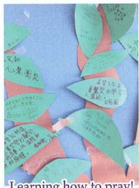
Learning how to pray!