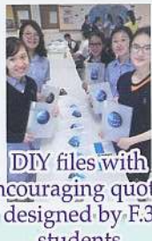
DIY files with encouraging quotes designed by F.3 students