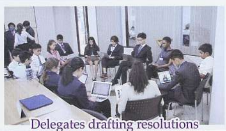
Delegates drafting resolutions