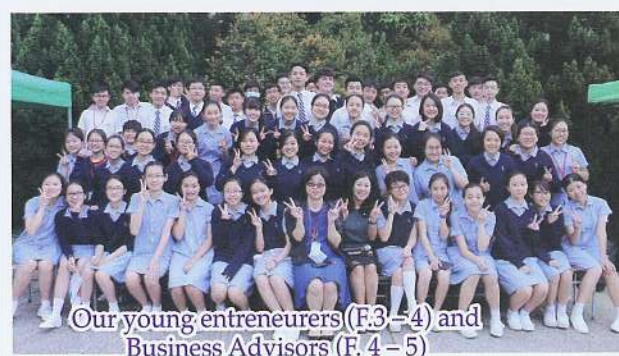
Our young entrepreneurs (F.3-4) and Business Advisors (F.4-5)