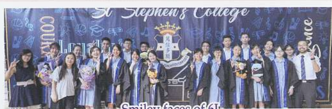
Smiley faces of 6J