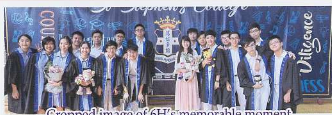
Cropped image of 6H's memorable moment