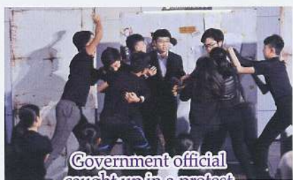
Government official caught up in a protest