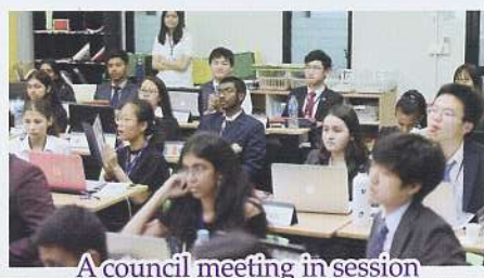
A council meeting in session