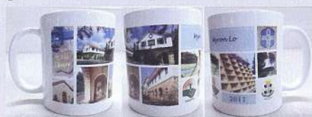
PTA personalized mug

As in last year, all S6 graduates received a personalized named mug from the Parent-Teacher Association as their graduation gift. We hope that this mug, which is printed with photos of SSC campus, will bring back many fond memories of their secondary school life. Besides the mug, a drawstring bag printed with a crest depicting different corners of SSC was also given to each graduate as a keepsake.