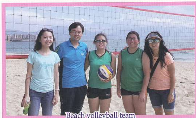
Beach volleyball team

Division II Beach Volleyball GIRLS B THIRD