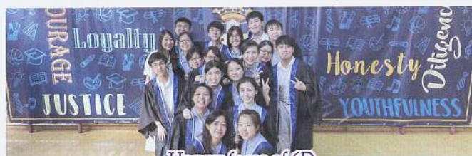
Happy faces of 6D