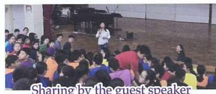
Sharing by the guest speaker

The S.1 Alpha Day Camp was held on the school campus on 18 May 2018. All S.1 students and some Christian teachers participated in this activity. We played, sang, shared and prayed together. With the assistance of brothers and sisters from the Incubator Ministries, Shau Kei Wan Baptist Church and Christian parents from our College Parent-Teacher Association, the camp was well-organized. Throughout the day, students were given opportunities to experience God's love, kindness and forgiveness.