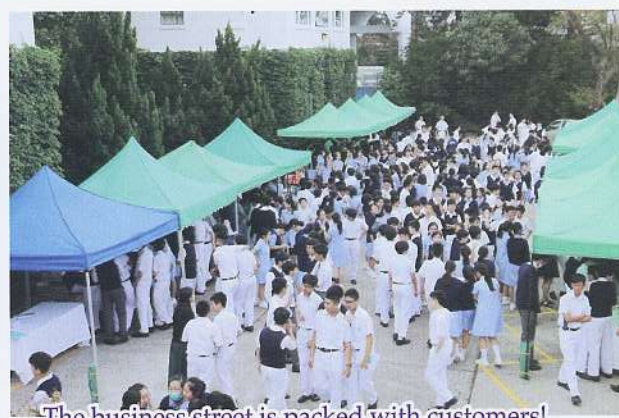
The business street is packed with customers!

On 25 April 2018, the Creative Business Program and the BAF Society jointly organized a trade-fair called "創業街 Business Guy!". There were 80 young entrepreneurs from F.3 to F.4 forming 15 student companies showcasing their DIY products. Under the guidance of business advisors of F.5 for 8 months, these business guys managed to implement business plans, produce ingenious TV advertisements, and put corporate social responsibilities into practice. Special thanks to the Music Society for their live music performance in the trade-fair.