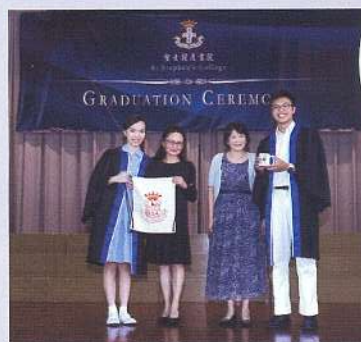
Presentation of graduation gifts to S6 student representatives