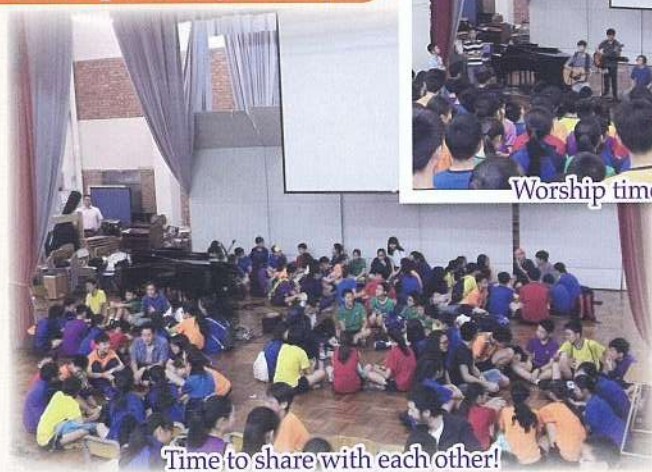
Time to share with each other!