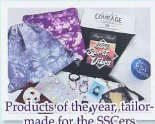
Products of the year, tailor-made for the SSCers