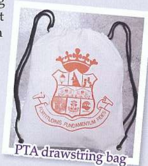
PTA drawstring bag