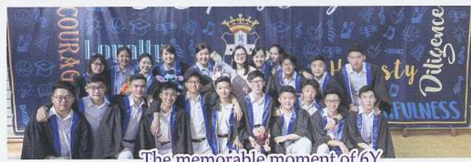
The memorable moment of 6Y