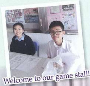
Welcome to our game stall!