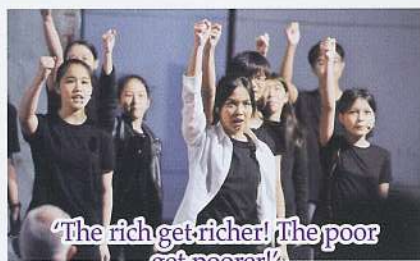
"The rich get richer! The poor get poorer!"