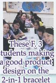
These F.3 students making a good product design on the 2-in-1 bracelet