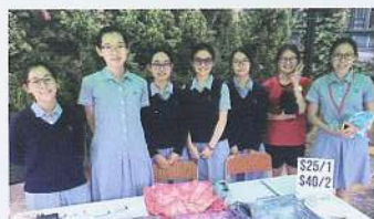
1 'Color-colorful' Tie-dye bags 2 selling at an attractive price