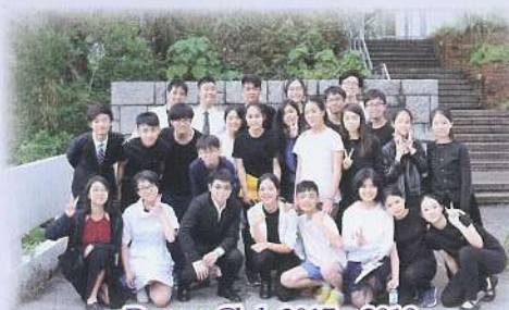
Drama Club 2017 - 2018

With such a creative and dynamic play, the team stood out among other schools and won the grand prize of Outstanding Performance, together with the award of Outstanding Directing. The team was invited to perform at the Prize Presentation Ceremony which was held on 9 th May, 2018 at Shatin Town Hall. All Form 1 students attended the ceremony and enjoyed the show.