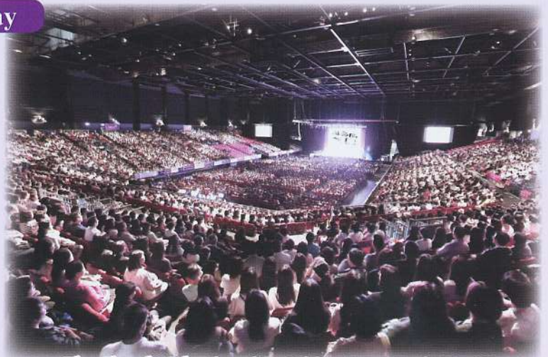
The Church, School, and Social Service, one of Hong Kong Sheng Kung Hui's 20 th anniversary celebratory events.

The Third Staff Development Day was held on 23 May, 2018 at Asia World Expo. Apart from the joint Staff Development Program, which is also an occasion to celebrate the 20 th Anniversary of The Province of Hong Kong Sheng Kung Hui Church.