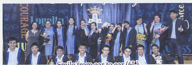
Smile from ear to ear (6L)