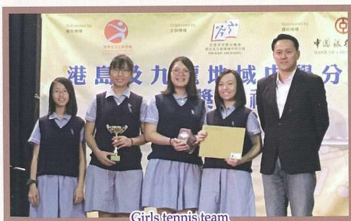
Girls tennis team