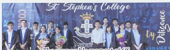
The memorable moment of 6C