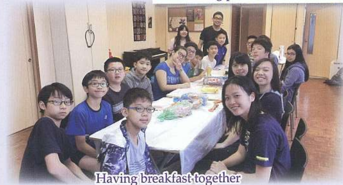
Having breakfast together