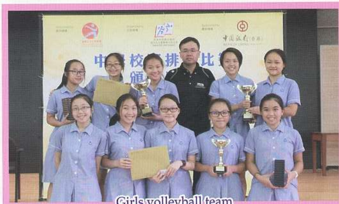
Girls volleyball team

Division II Girls Volleyball GIRLS B OVERALL THIRD GIRLS C OVERALL FOURTH GIRLS OVERALL THIRD