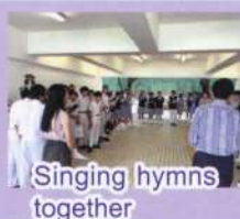
Singing hymns together