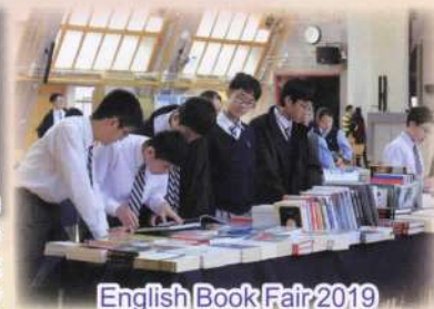
English Book Fair 2019