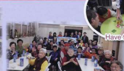
The elderly people enjoyed the activities organised by our students