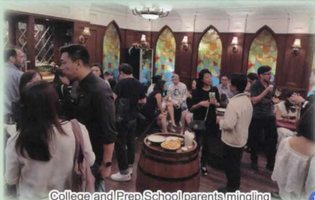
College and Prep School parents mingling