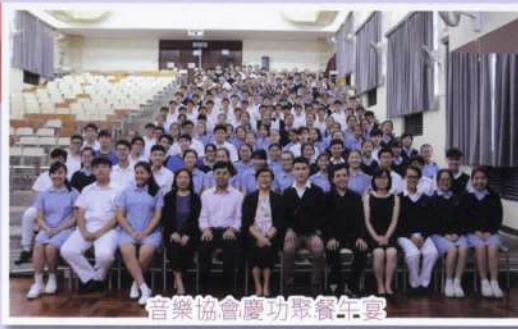
音樂協會慶功聚餐午宴