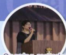
Opening remarks by the Principal