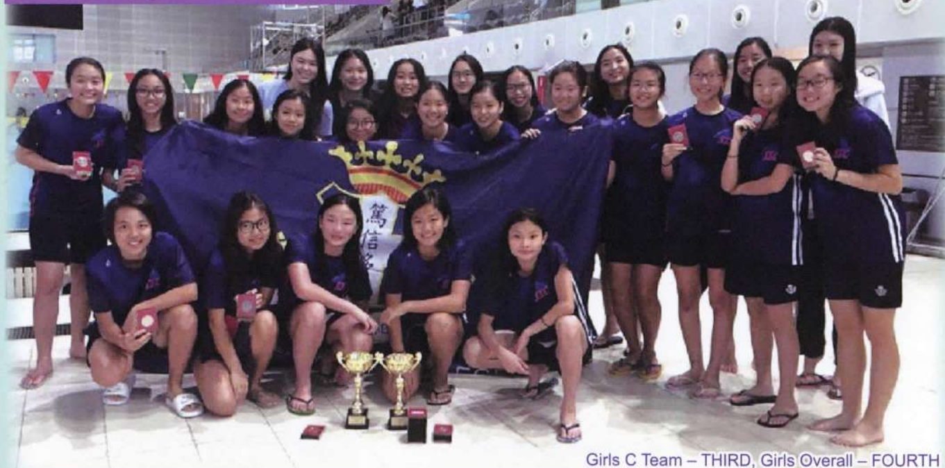
Girls C Team – THIRD, Girls Overall – FOURTH