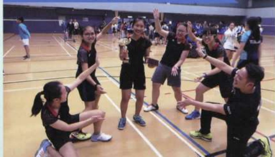
Girls A Grade – SECOND, Girls Overall – FOURTH