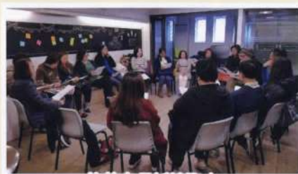
校外家長祈禱聚會