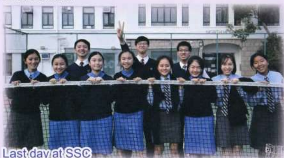
Last day at SSC