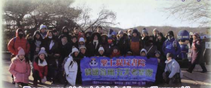
The sun was shining brightly but it was still very cold!