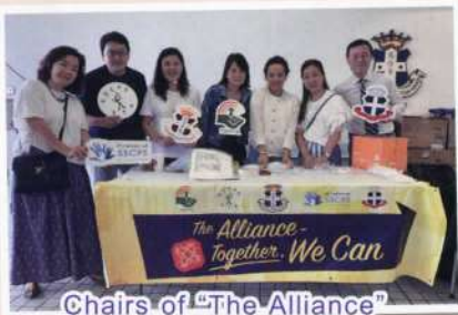
Chairs of "The Alliance" and parent volunteers