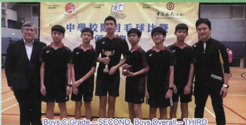
Boys C Grade – SECOND, Boys Overall – THIRD