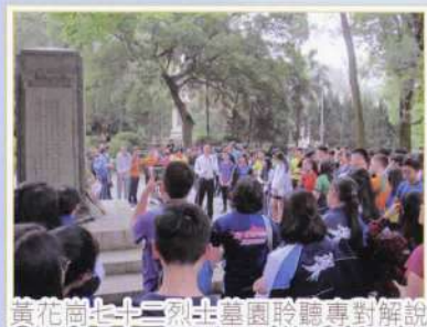
黃花崗七十二烈士墓園聆聽專對解說