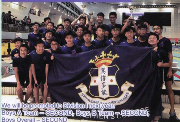
We will be promoted to Division I next year. Boys A Team – SECOND, Boys B Team – SECOND, Boys Overall – SECOND