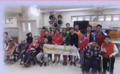
Students learnt how to communicate with the intellectually-disabled people

On their Service Learning Days, S3 and S4 students visited elderly citizens and intellectually disabled people respectively. They worked in small teams to organise some fun activities and bring joy to them. The Service Learning Programme aims to raise students' awareness of the needy in our community. They learn best by doing, serving and reflecting on their experience.