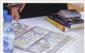
Inspirational cards from our Artistic Crew given to students upon any book purchase at the Book Fair