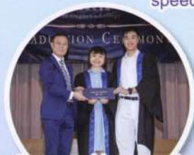
A memorable souvenir from SSCAA