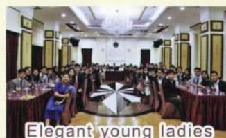
Elegant young ladies and gentlemen