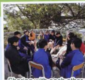
Sharing with each other

The S1 Alpha Day Camp was held on the school campus on 17 th January, 2019. All S1 students and some Christian teachers participated in this activity. We played, sang, shared and prayed together. With the assistance of our brothers and sisters from the Incubator Ministries, Shau Kei Wan Baptist Church and Christian parents from our Parent-Teacher Association, students were given opportunities to experience God's love, kindness and forgiveness.