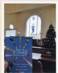
SSC Prayer Day