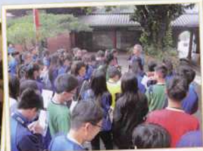
懷聖寺內專心聽老師講解