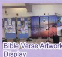
Bible Verse Artwork Display