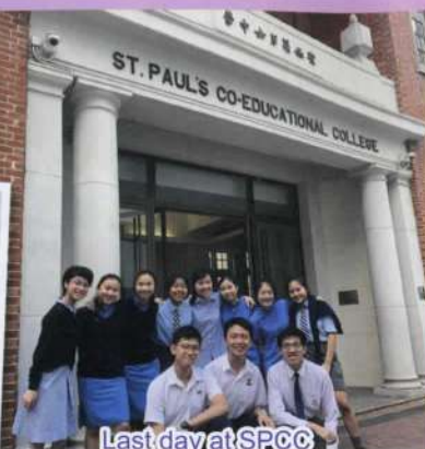
Last day at SPCC