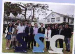
Some of our mentors in the 2018-19 academic year