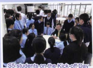
S5 students on the Kick-off Day

In collaboration with the Alumni Association, the annual Mentorship Programme for S5 students kicked off on 16 th November, 2018. More than a hundred students signed up and they were paired up with mentors of various professions, such as finance, insurance, medicine, law, engineering, film directing, fashion design, advertising and logistics. They gained knowledge of their mentors' disciplines and were equipped with practical workplace skills through company visits and job shadowing from December to June.