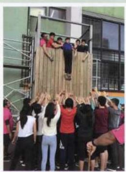
群策群力，團結解難

聖士提反書院傳統以全人教育，培育精英為鵠的，多年來挑選學校精英為學長，作為同學的表率，學習的楷模。為了培育這些精英成為學生領袖，學校每年都會舉辦不同形式的領袖訓練活動。本年一月舉行了學長領袖訓練日營，透過不同的解難及挑戰自我能力的活動，團結學長之間的互助互補精神，發揮合作解難的能力，使到學長團隊能更茁壯成長。