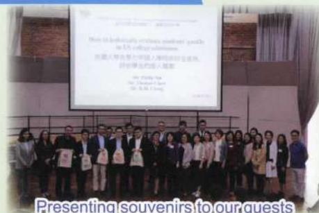
Presenting souvenirs to our guests