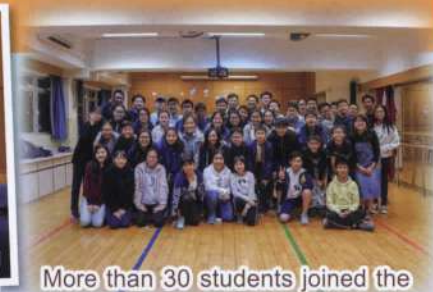
More than 30 students joined the camp this year