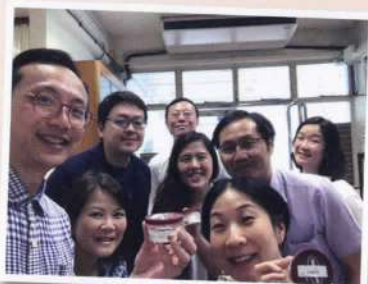
Before the surprise visit

To celebrate students' achievements in music, sports, STEM and other areas in this academic year, "The Alliance", a joint group comprised of the SSC Alumni Association, Parent-Teacher Associations of SSC and SSCPS, and Friends of SSCPS made a surprise appearance at the school assembly on 23 rd May, 2019 to treat all students, teachers and staff to Häagen-Dazs ice cream. The event was sponsored by the executive committee members of the four associations and an anonymous donor. It was the first time in history that so many students had ice-cream together in the TSK Hall. Students, teachers and staff at the Preparatory School also enjoyed ice-cream after lunch.