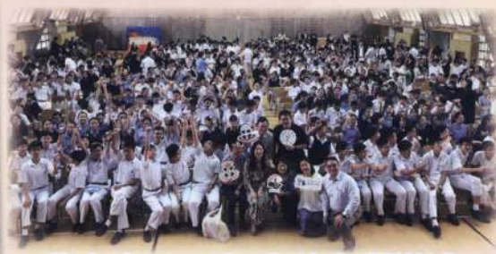
Having ice-cream together in the TSK Hall