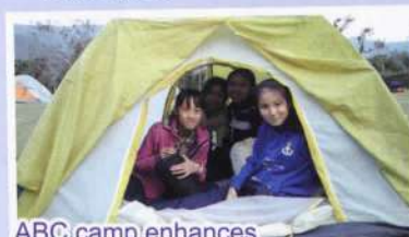
ABC camp enhances students' friendships

In order to help our students cope with different challenges, S1 students were required to attend an Adventure-based Camp at Tai Tam Scout Centre, as part of the Mandatory Boarding Programme. They hiked, camped in the wild and cooked their own meals, building up team spirit and self-confidence.