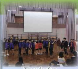
Time for fun