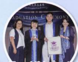
Thoughtful parents from SSCPTA