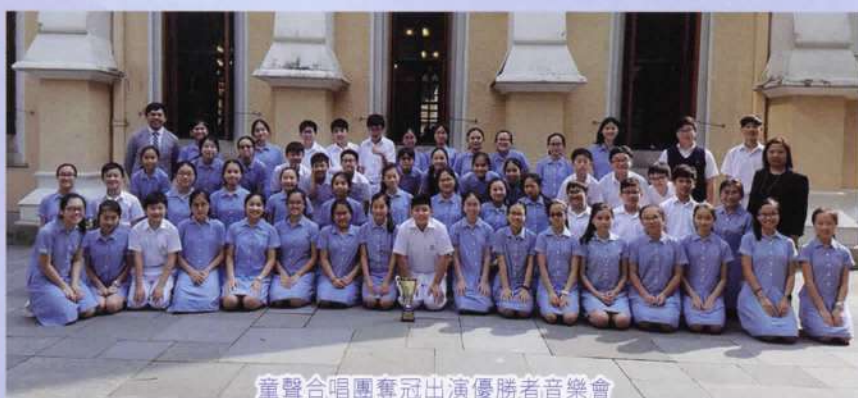
童聲合唱團奪冠出演優勝者音樂會