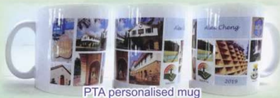
PTA personalised mug

As in last year, all S6 graduates received a personalised mug from the Parent-Teacher Association as a graduation gift. We hope that this mug, which is printed with SSC campus photos, will remind them of many fond memories of their secondary school life. Besides the mug, a drawstring bag with a special school crest was also given to each graduate as a keepsake.