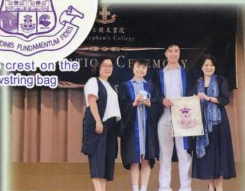
Presentation of graduation gifts to the S6 student representatives