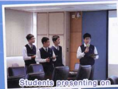
Students presenting on their STEM projects